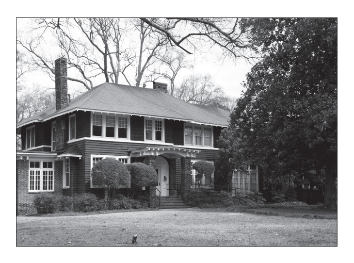
The Fitzgeralds' house in Montgomery, Alabama