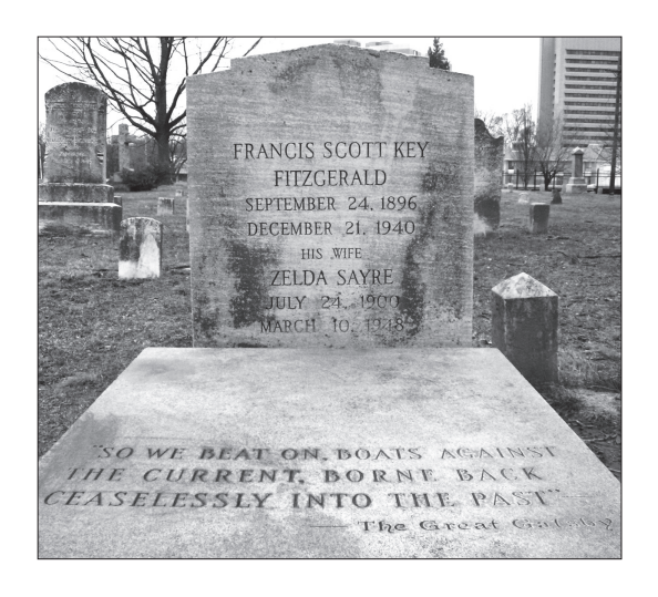
The Fitzgeralds' grave in Rockville, Maryland, inscribed with the closing line from The Great Gatsby