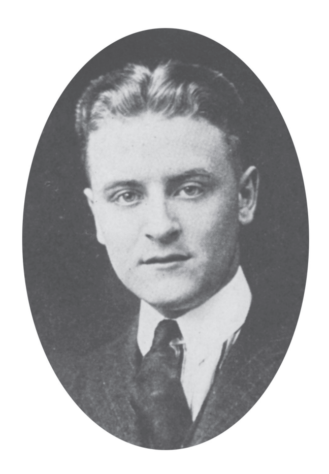
F. Scott Fitzgerald (1896–1940)