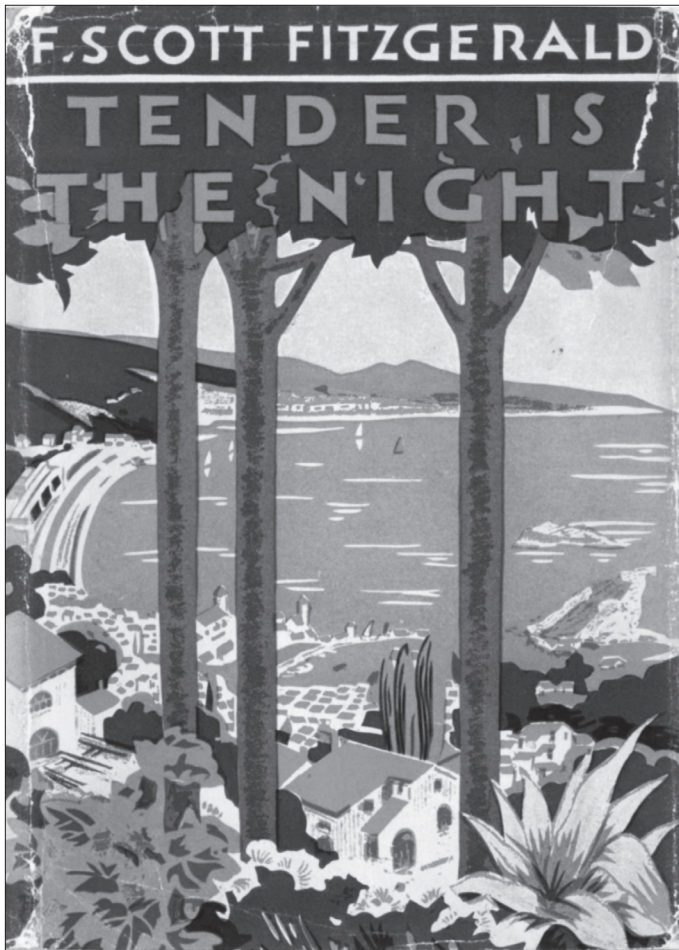
The original cover illustration for Tender Is the Night