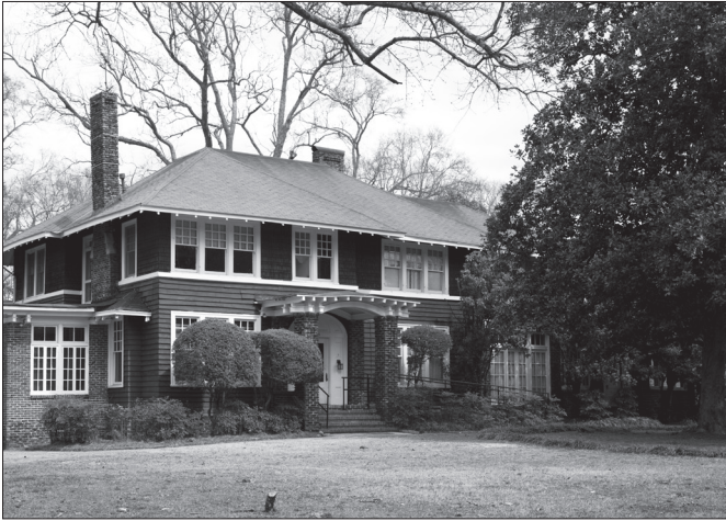
The Fitzgeralds' house in Montgomery, Alabama