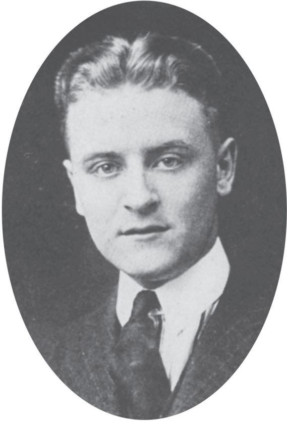
F. Scott Fitzgerald (1896–1940)