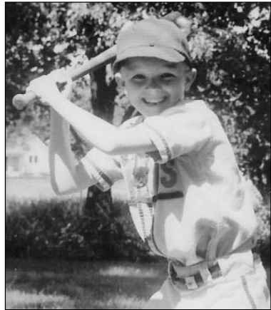
Me at elementary school, USA.

This is a book about how IT happened – in particular, how we went from there being nothing at all to there being something. And then, how a little of that something turned into us, and also some of what happened in between – and since.