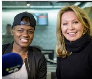
Boxer Nicola Adams with Kirsty Young (left) and Paul McCartney (right), whose favourite disc was John Lennon's 'Beautiful Boy'.