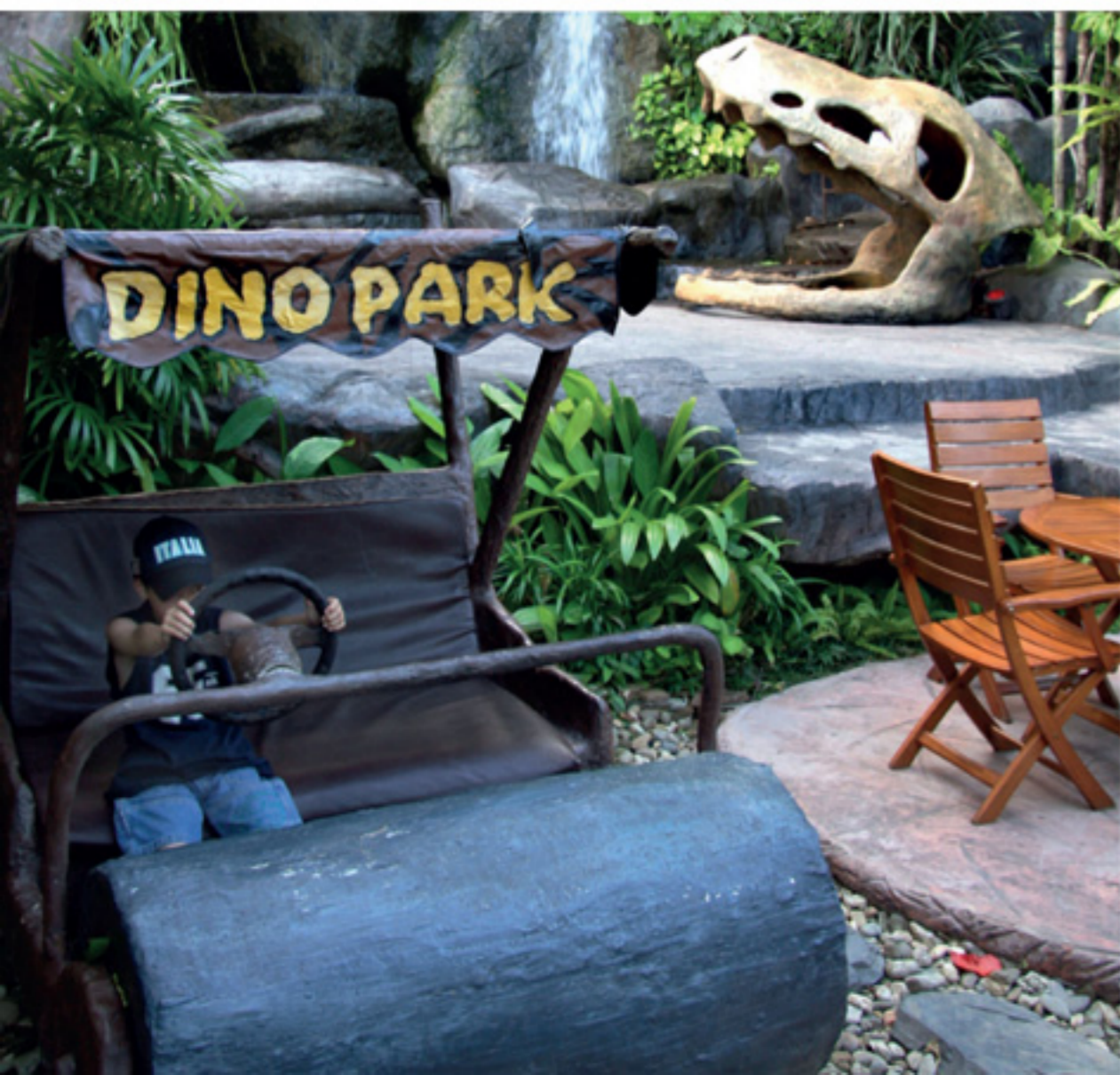
Kitsch Dino Park.