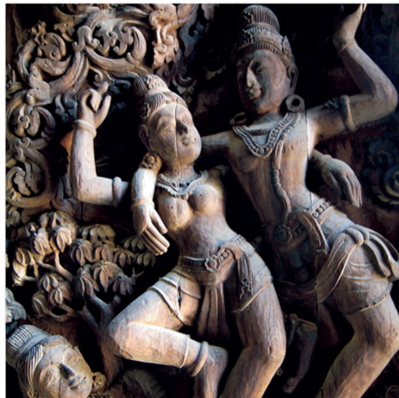
Detail of the Sanctuary of Truth, Pattaya.

Reggae Bar: Ko Phi Phi. The island's biggest and best party venue has its own Thai boxing ring.