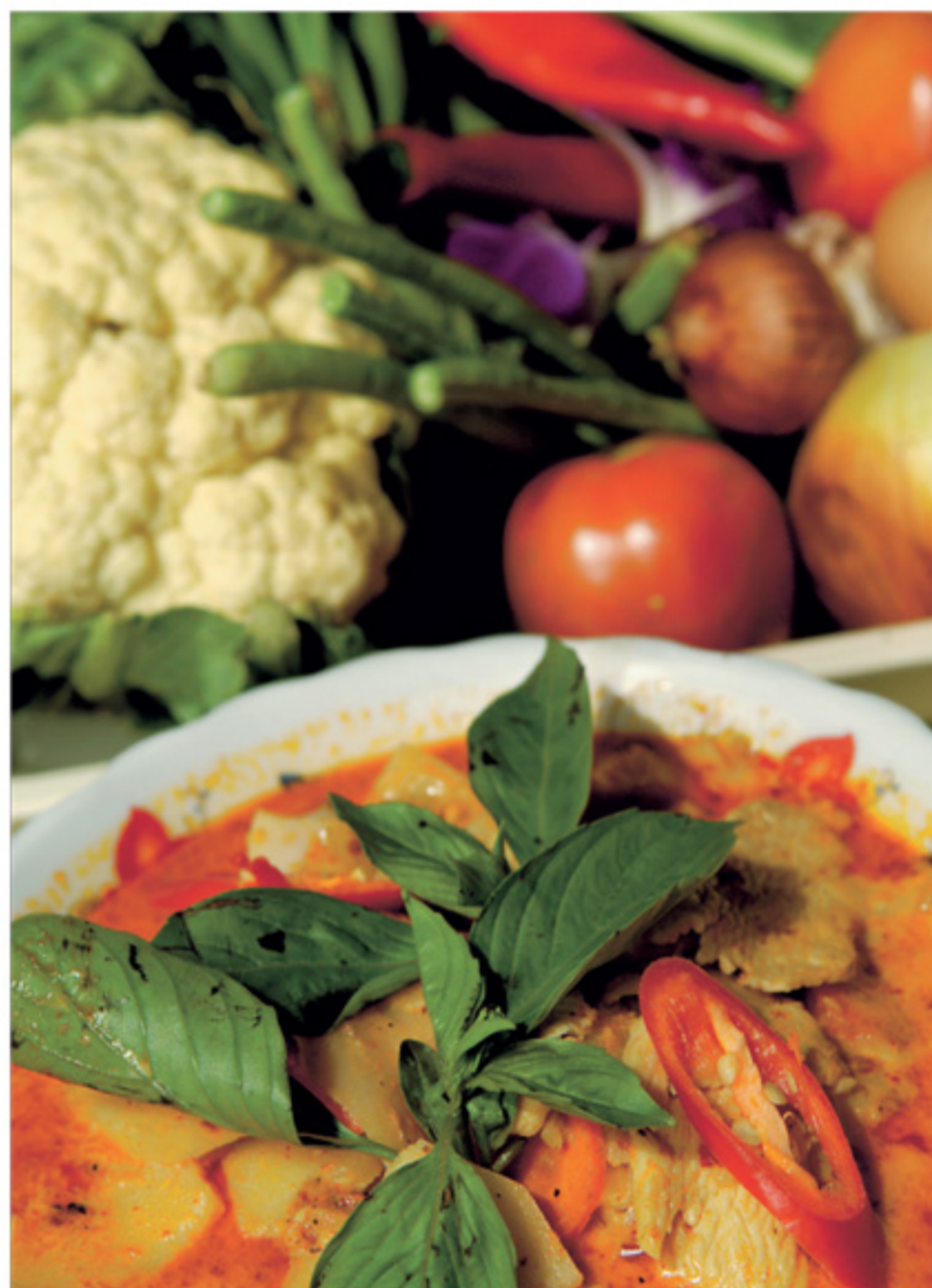
Red Thai curry.

Samui. Watch monkeys scamper up trees at lightning speed to pluck coconuts from the palms. See page 139.