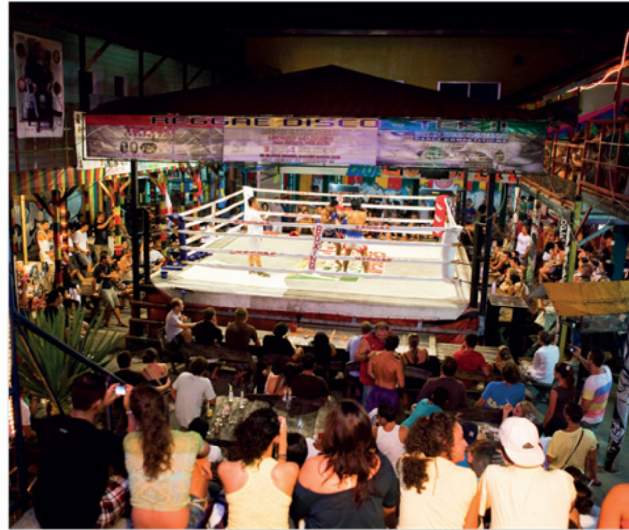
Revellers watch a Muay Thai boxing Match.

Vimanmek Mansion: Bangkok. Billed as the world's largest golden teak structure, this former 19th-century royal summer home has lots of period artefacts. See page 93.